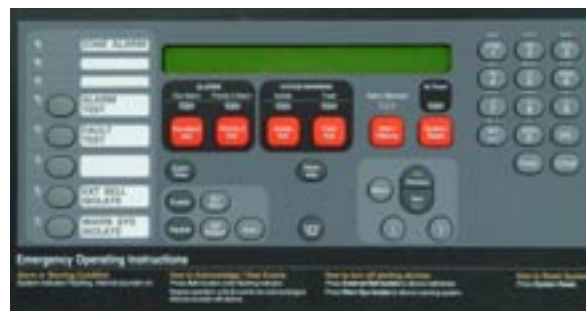
Simplex 4100U-S1 Operator Keypad