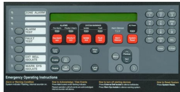
4100U Operator Keypad